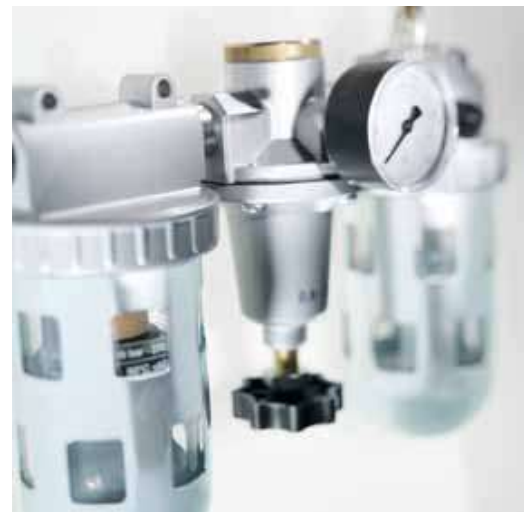
At home in tough everyday practice: the Standard series.