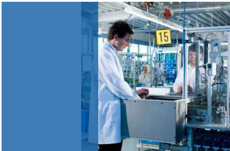
Our production – professional and committed.

Our Standard series made of die-cast zinc has proven itself in tough everyday practice. Shockproof, it shows its true size, and not only in terms of its dimensions. The units in this series can master up to 3-inch connections and higher flow rate volumes with absolute assurance.